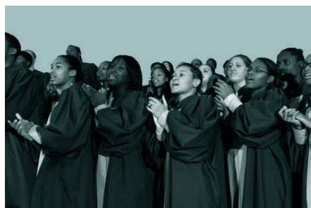
McDaniel College Gospel Choir