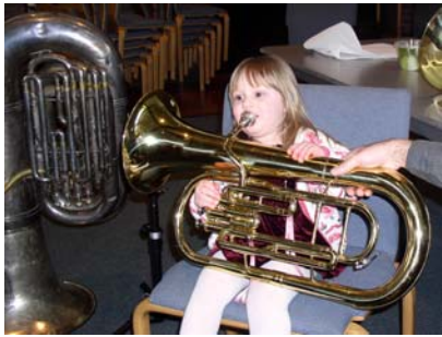
A visit to the orchestra's Musical Instrument Petting Zoo

The Columbia Orchestra considers the introduction of classical music and the instruments of the orchestra to young people to be a primary element of its mission. The annual Young People's Concert, free to children ages 11 years and under, was held at Rouse Theatre on November 18, 2008. The audience of 631 that attended the two performances